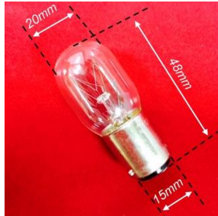
BA15D Push-in bayonet base 20x48mm