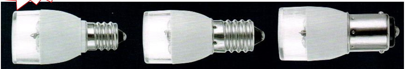
E12 Screw base (Ø 22mm x 45.5mm)