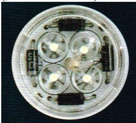
General style (GE)