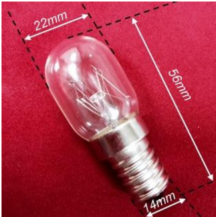
E14 Screw base 15W 22x56mm