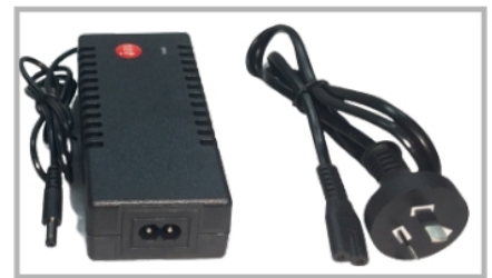
Charger + cord